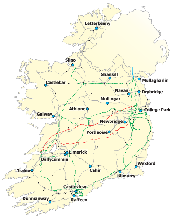
Figure 9-1 110 kV Stations Studied for Demand

Based on feedback from industry, a different set of stations to the ones chosen for generation was selected for the analysis of additional demand. It is intended that this new selection will make the results more meaningful to the potential developers. The twenty-two 110 kV stations selected, which feed principal towns and demand centres distributed throughout the country, are shown in Figure 9-1.